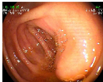
Ileocecal valve Terminal ileum