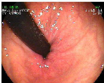
Retroflex view Anus

The patient was instructed to return to patient's primary care physician in 2 weeks. Continue present medications. High fiber diet, no nuts, popcorn or seeds. Please call office in 1 week for biopsy results.